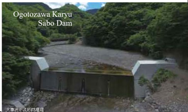
Ogotozawa Karyu Sabo Dam