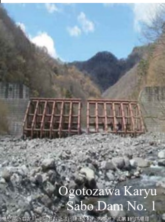
Ogotozawa Karyu Sabo Dam No. 1

Sabo works began in 1952 to prevent this. Currently, 49 sabo dams are maintained in the Kinugawa River basin.