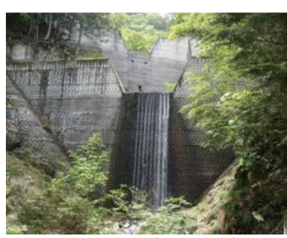
Hacchoyusawa Sabo Dam