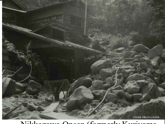
Nikkozawa Onsen (formerly Kuriyama Town) debris flood damage

Nikkozawa Onsen was also damaged by a debris flood