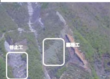
Wicket work, check dam work

To prevent this, Onagi Sanpukuko (major hillside decking work) is conducted. "Nagi" refers to collapsing marsh terrain formed from crumbling ridge areas, summits, etc.