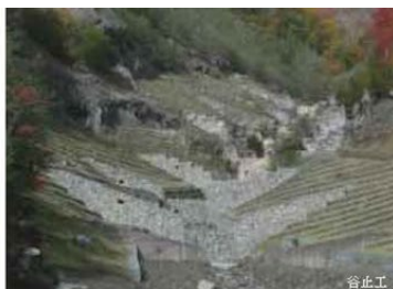
Check dam work