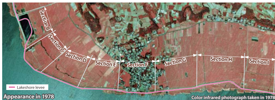
Section B was once used as a temporary dumping yard for sediment dredged from the lake.